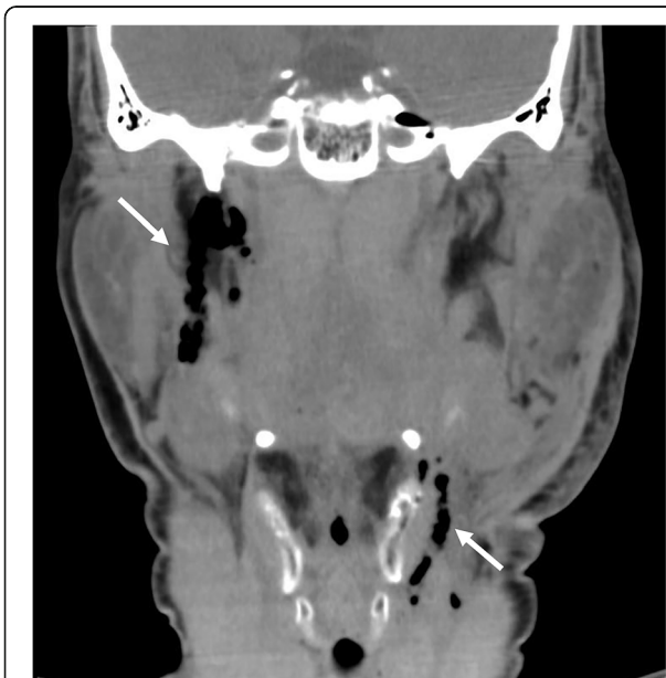
Fig. 1 Computed tomography scan showing air in the regions of the left mandible and right styloid process of the temporal bone (white arrows), suggesting a penetrating neck injury extending to the skull base

revealed anemia (hemoglobin, 9.5 g/dl; hematocrit, 28.5%) and prolonged prothrombin time (percentage of standard value, 60.2%).